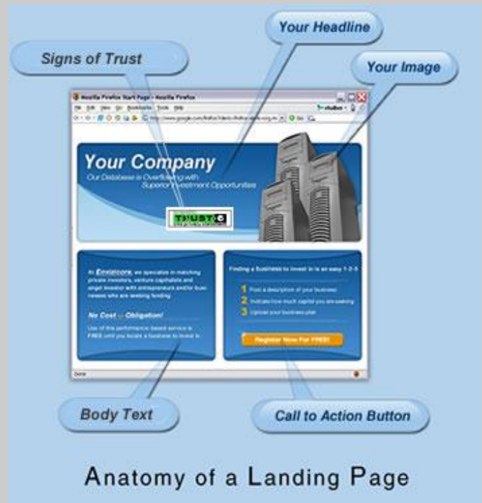
Anatomy of a Landing Page

With prices to suit even the smallest budget we can create a cutting-edge first impression for your page, no matter what your page is about.